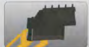
6 in 1 Bucket

"39 types of application specific quick interchangeable loader bucket options"